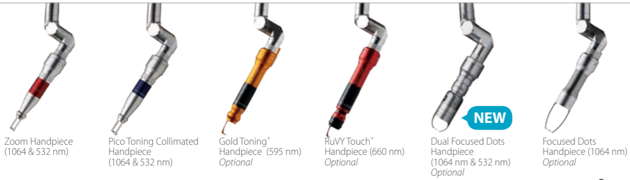
Zoom Handpiece (1064 & 532 nm)